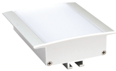
shown with closed end cap